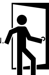
STANDING OUTSIDE BUILDING

Hinges are on the left. Door opens away from you.