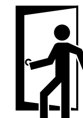
STANDING OUTSIDE BUILDING

Hinges are on the right. Door opens away from you.