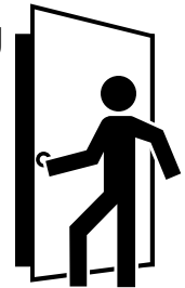
STANDING OUTSIDE BUILDING

Hinges are on the right. Door opens toward you.