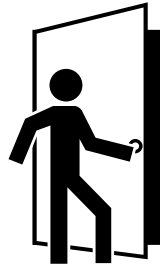
STANDING INSIDE BUILDING

Hinges are on the left. Door opens toward you.