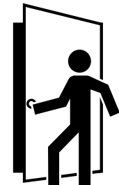
STANDING INSIDE BUILDING

Hinges are on the right. Door opens toward you.