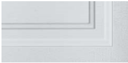
Decorative panel edging and natural embossed woodgrain texture improve appearance close-up and from the curb.