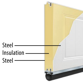
Steel Insulation Steel