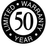
Heritage Premium Heritage Vintage

Transferability: The Owner of Heritage, Heritage Woodgate, Heritage Premium and Heritage Vintage shingles may transfer this Limited Warranty one (1) time during the first five (5) years of the Term to a Purchaser of the building upon which the Shingles are installed. The Owner of Elite Glass-Seal and Glass-Seal shingles may transfer this Limited Warranty one (1) time during the first two (2) years of the Term to a Purchaser of the building upon which the Shingles are installed. The transfer must occur simultaneously with the sale of the building. To transfer this Limited Warranty, the Owner must provide TAMKO with written notice within thirty (30) days after the transfer. The written notice must include the names of the Owner and the Purchaser, the address of the building upon which the